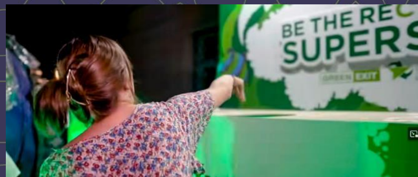
Green EXIT 2023 Aftermovie